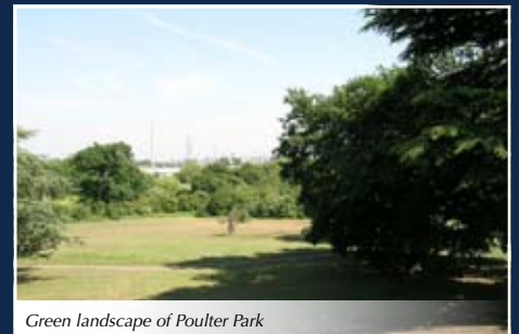
Green landscape of Poulter Park

Bishopsford House is located off the A217 close to an excellent range of transport links including road links to the M25" says Sean Purtill, Partner at Ellisons. "The frequent Croydon Tram link is just a short walk away and from its first stop, Mitcham, Victoria Station is less than twenty minutes by train. Wimbledon is also easily accessible and provides access to District Line and British Rail services".